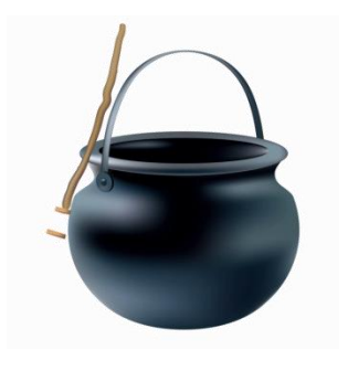
Part 3: Spells

Every witch or wizard needs a magic wand, so here's a challenge for you to get your creative cloaks on and make your own!