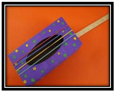
guitar as you would like!